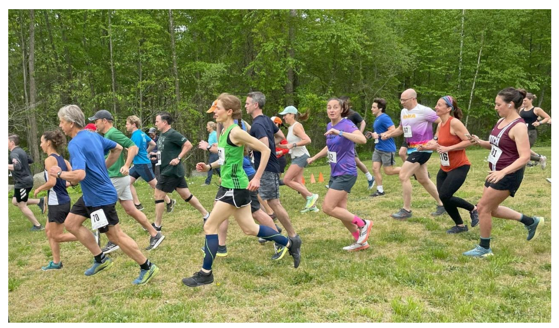
Runners at the start of the May 20, 2023 Dogtown Trail Race

The Cape Ann Trail Stewards Annual Dogtown Trail Race was held on May 20 this year and had over 100 registrants, from the North Shore area to many towns throughout Greater Boston, as well as other parts of New England (from Rhode Island to Maine), and beyond!