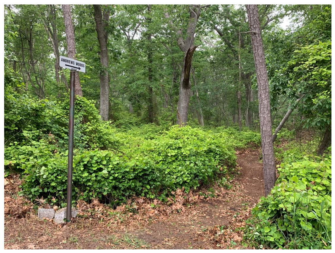
One of the entrances to Andrews Woods in Rockport, shown here after volunteers did extensive clearing of catbriar and other overgrowth during the May 2023 Trail Work Day

Group Trail Work Days are at the heart of Cape Ann Trail Stewards' mission, as we strive to involve and engage the local community in ongoing maintenance of the Cape Ann Trail networks.