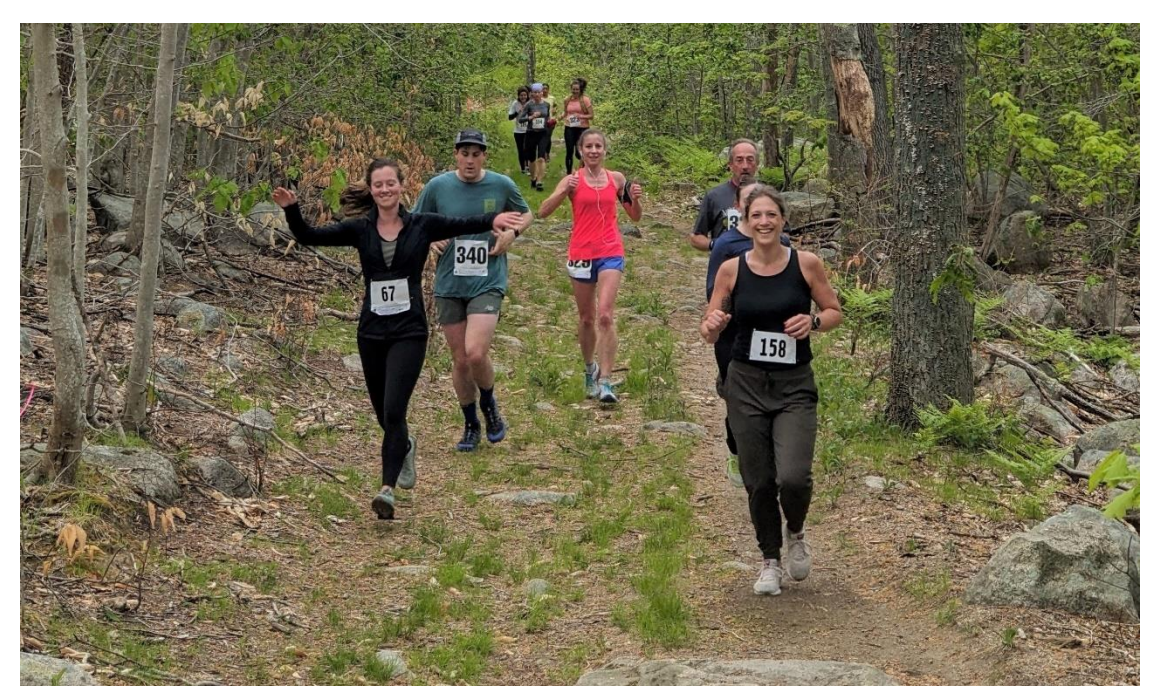
Runners mid-course during the race

And of course we are also indebted to the many volunteers (helping with parking, at registration and check-in, on the race course as supporters and safety monitors, at the finish line, and those who swiftly cleaned up all markings on the route and everything at the start-finish line immediately after the event ended), whose help and supportive presence made the event the success it was!